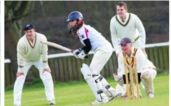
Practice Play Junior