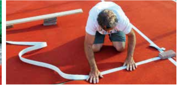
4_In Laid Line