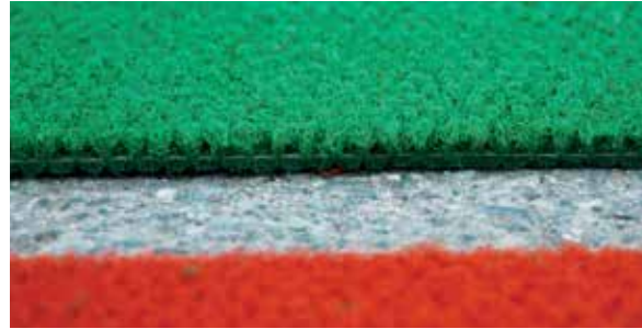
3_In Laid Line